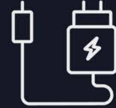
Charger and power supply (battery or generator)