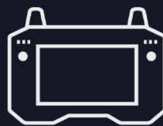
Skyfish remote controller