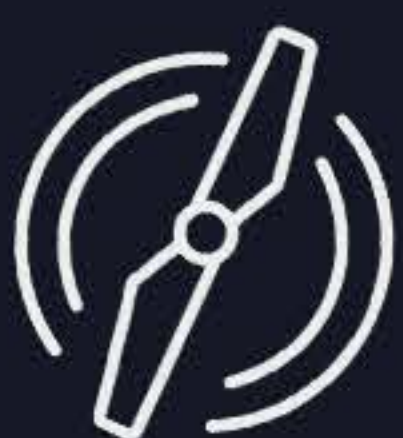
Propellers (2 sets of 4)