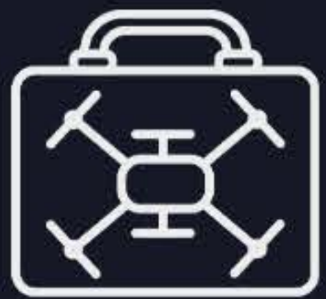
Pelican™ travel case