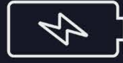
Flight batteries (2 sets, Li-Ion, 6s 24000mAh)