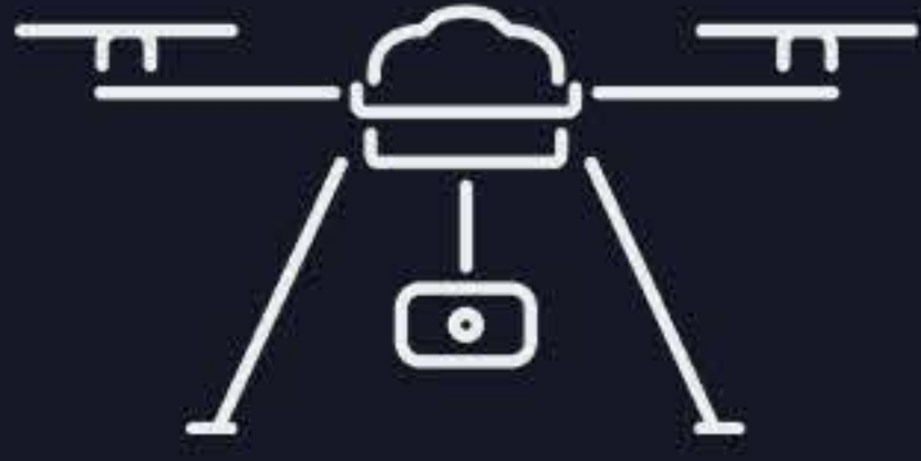
Skyfish M4 drone platform